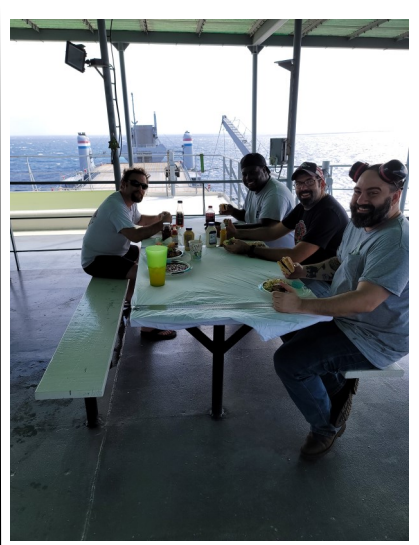
Cape Race crew members gather to enjoy an at sea BBQ

Cape Rise was excluded from CE training and successfully conducted a maintenance sea trial. Cape Race, Cape Decision, and Cape Domingo performed successful maintenance sea trials and CE training. Hurricane Ida's threat to the Gulf Coast provoked a cancellation of the at-sea events for all New Orleans based RRF vessels, including Cape Kennedy. Due to the devastation in the New Orleans metro area, Cape Kennedy and nested pair sister ship Cape Knox were made available to accommodate FEMA first responders during the aftermath of the storm.