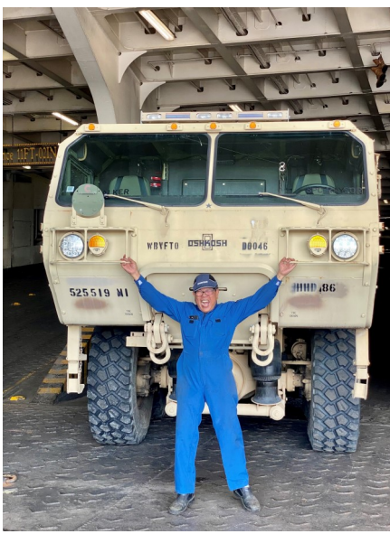
Scream and shout to a job well done!