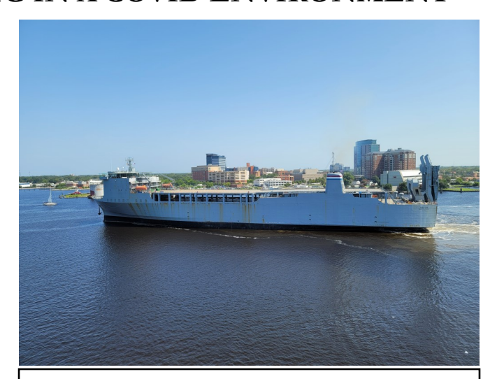
Cape Rise departs Portsmouth, VA

Special orders for activation included a seven-day Restriction of Movement (ROM) period followed by a five-day activation period and a 3 to 5-day Operations period (3 days for a normal maintenance sea trial or up to 5 days for a maintenance sea trial followed by Contested Environment