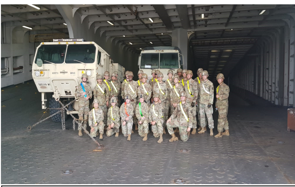
519th Expeditionary Military Intelligence Battalion