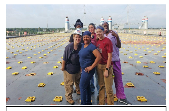
Strong women represented on the Cape Rise

When the Turbo Activation bell rang, all Keystone shipboard and shoreside personnel answered the call and responded in classic Keystone fashion to complete their Turbo Activation orders efficiently, professionally, and safely.