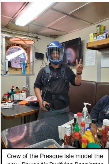
Crew of the Presque Isle model the new Power Air Purifying Respirator (PAPR)