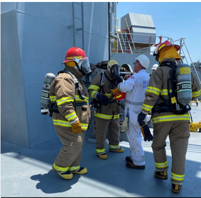
Team Leader on Cape Decision inspecting fire fighters prior to departing for scene

A job well done and thank you to all crew members for contributing to these successful audits.