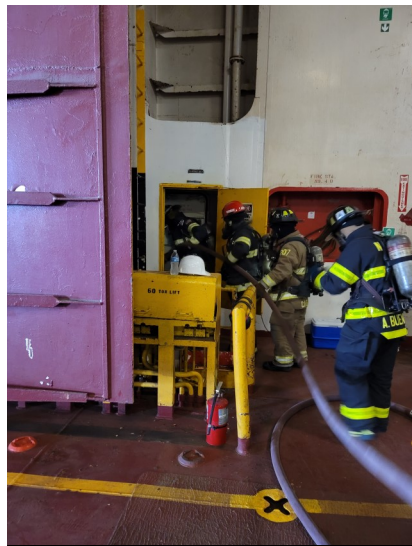
Fire Teams Entering Engine Room