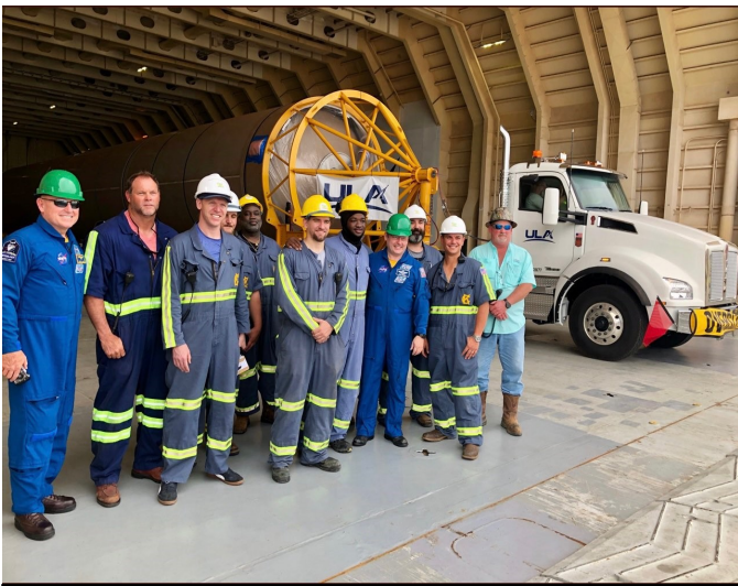
The crew of the Rocketship and sponsors from ULA are all smiles as they load cargo in Decatur, AL