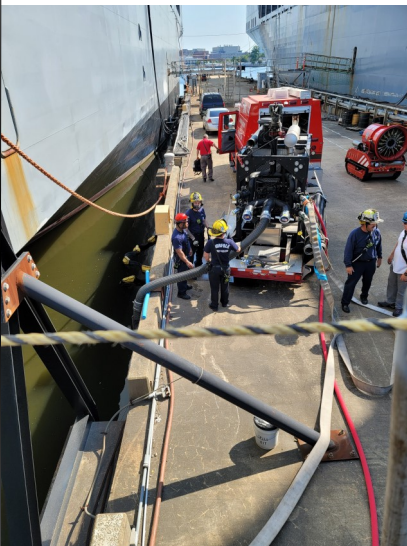
Shoreside Fire Main Supply Truck