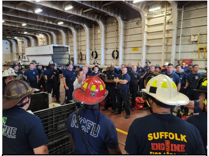
Opening Safety Meeting