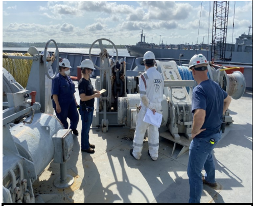
ABS & USCG Inspecting Mooring Gear with the Chief Engineer and Chief Mate of Cape Ducato