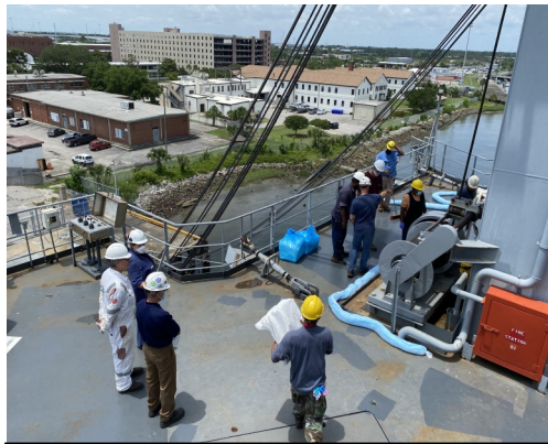
Cape Ducato executing a SOPEP drill for ABS & USCG, as part of the ISM Audit