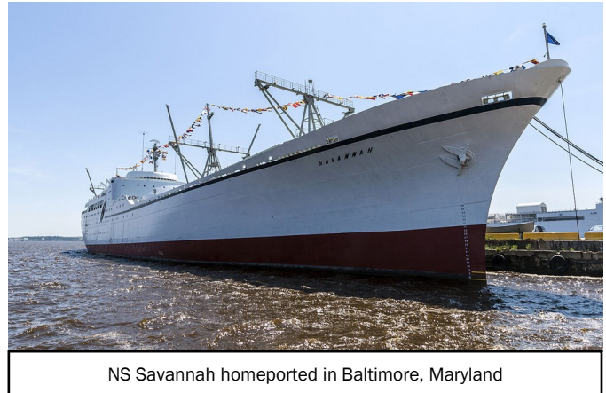
NS Savannah homeported in Baltimore, Maryland

We are proud of this new opportunity to return the Keystone company flag on the NSS, and we look forward to working with RSCS on this important project.